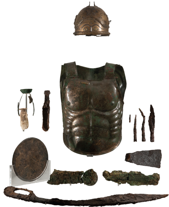
Fig. 1 Lanuvium, Funerary set of a warrior.

Athleticism and sport practice exercised a deep influence on the imagination of the Etruscan and Italic peoples for a long time. Therefore, during the Hellenistic period the number of products for body care increased significantly. For example, the diffusion of strigils reached high levels in funerary contexts. 4 Often realized in terracotta, they were used for their symbolic meaning rather than their practical function. Similarly,