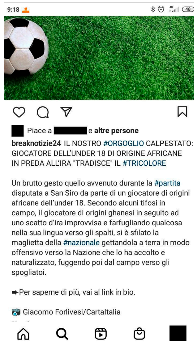
Figure 2. Racial hoax example.

giving him a specific name and story (son, father, and boy scout) based on the description of personal details that would try to give a counter-stereotypical image and emotional experience of him in order to induce empathy. If in the misleading news he was an illegal immigrant, here he is a good person helping others, concerned for the safety of his son.