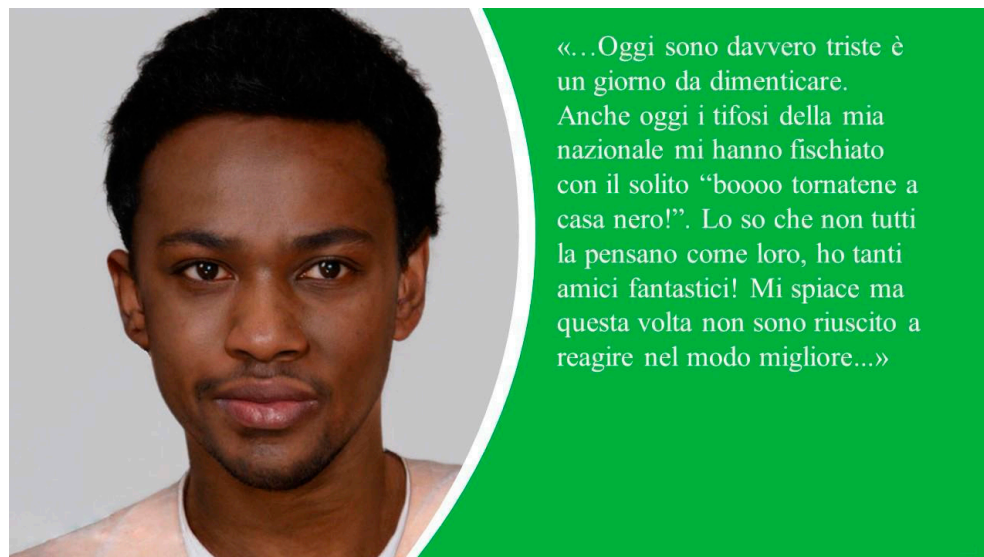
Figure 3. Alternative news item based on the immigrant’s point of view.

Finally, the Socio-Analytical Processing of Misinformation index was obtained by summing the scores obtained from the various tasks, after having standardized them to avoid possible bias effects due to the different measurement scales of the individual items for each task.